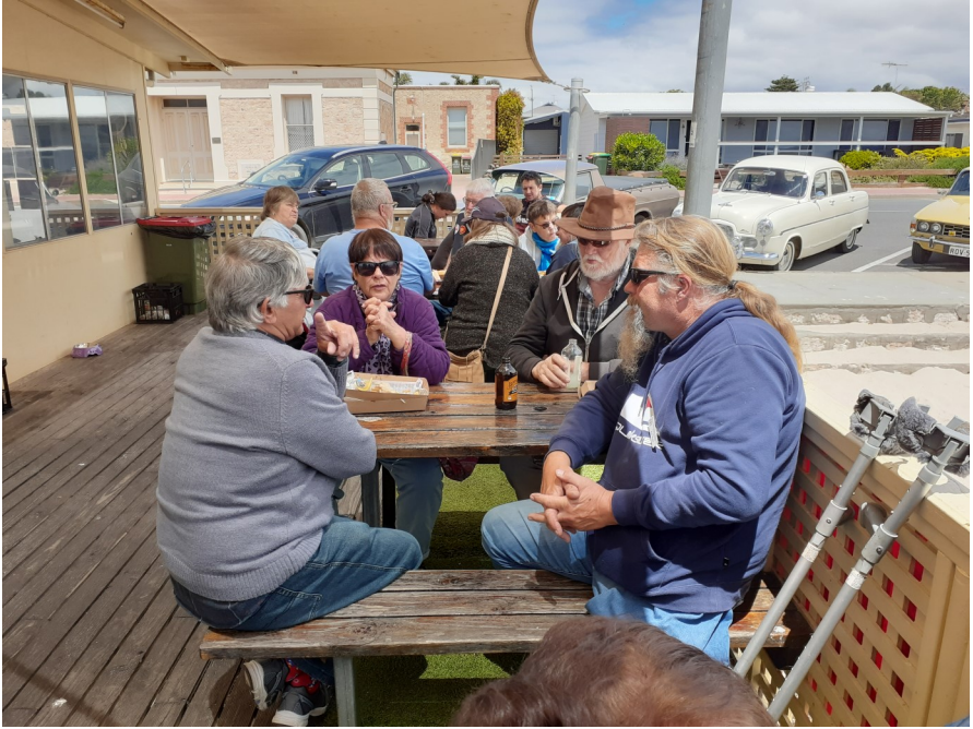
HAPPY EATERS AT THE PORT VINCENT KIOSK